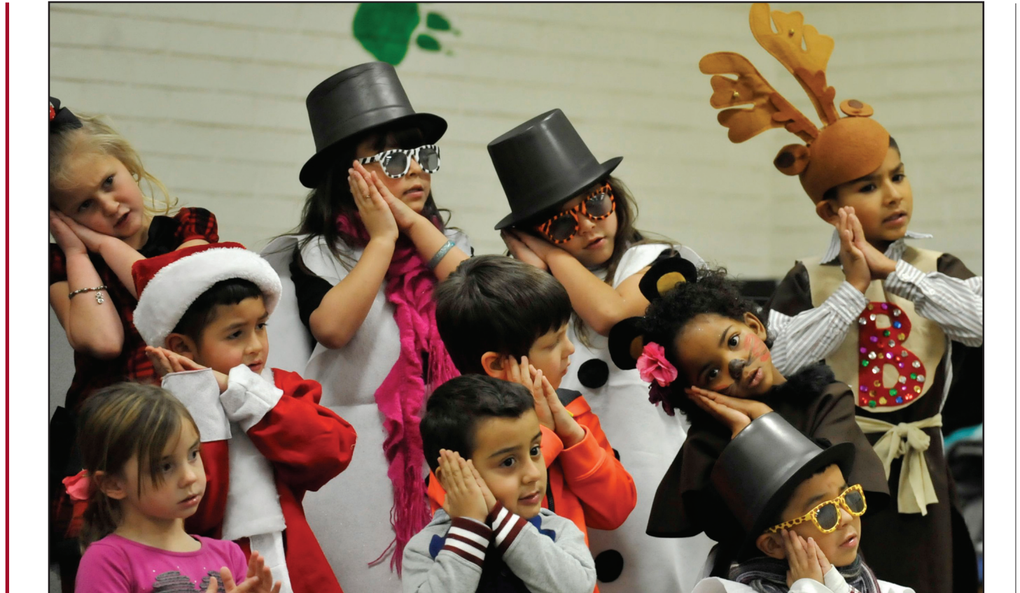
Happy Holidays at Taylor Elementary

Kindergartners from Taylor Elementary in Hobbs put on a Christmas program for their parents recently.