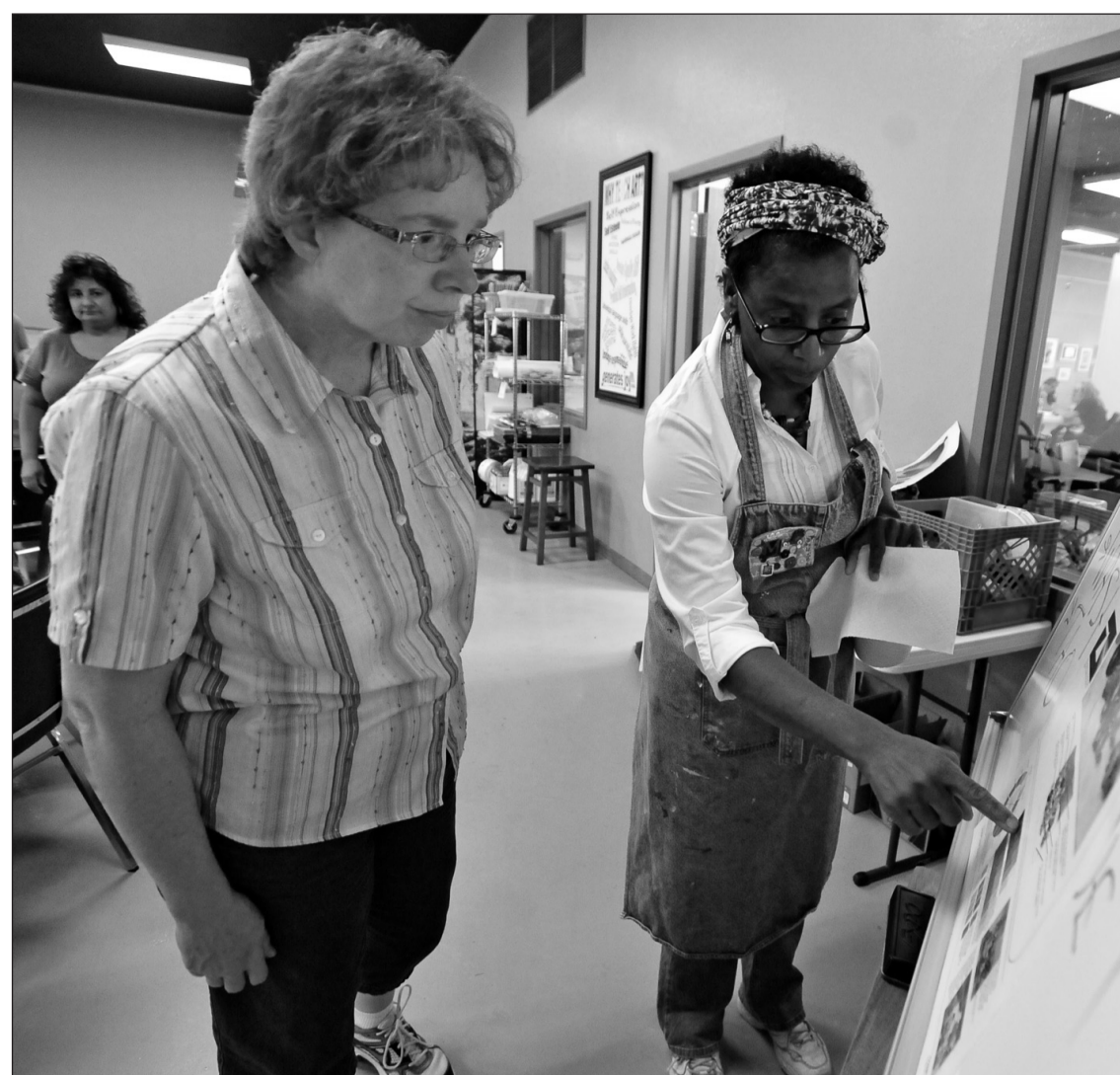
HOBBBS SCHOOLS PHOTOS

More than 1,200 firefighters are battling the blaze, which has destroyed a dozen cabins.